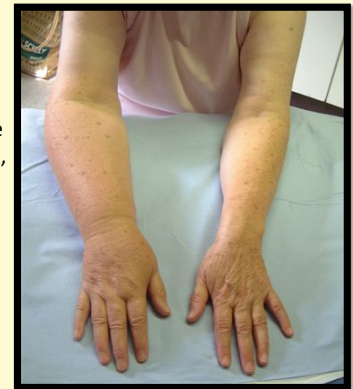
Figure 1. Swollen arm as a result of lymphoedema after breast cancer treatment

Reflexology is a physical therapy focusing on the feet. Practitioners use specific pressure with thumb, finger and hand techniques to stimulate these reflexes on the premise that this effects a physical change in the body. Anecdotally, cancer patients suffering from lymphoedema have reported positive effects on the swollen arm after reflexology treatment.